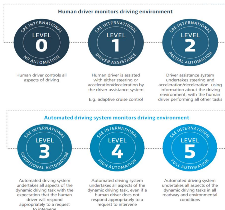
Figure 3-1 - Autonomy Scale

With various levels of Autonomous (Self-Driving) Vehicle (AV) technology, from driver assist through to fully automated driverless vehicles, it's important to understand the different terminology used. The SAE International Standard J3016, sets out the taxonomy used when discussing the levels of autonomy: